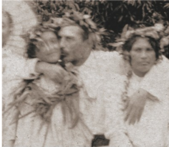
(1) Paul Gauguin with Two Women in Tahiti, July 19, 1896