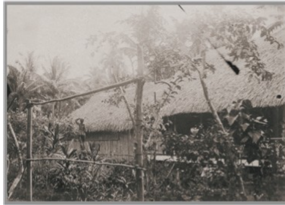
The House of Paul Gauguin in Tahiti, 1896

I knew that „our“ photo was in there as well as an additional one showing Gauguin in a different posture, plus the famous one of his house in Tahiti.