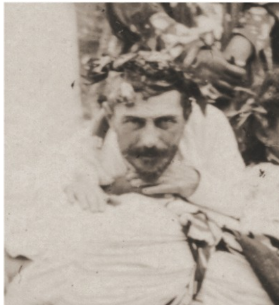
(2) Paul Gauguin in Tahiti, July 19, 1896

The first Agostini album was preempted by the French Government for the MQB, the second – now mine – was allowed to leave the country.